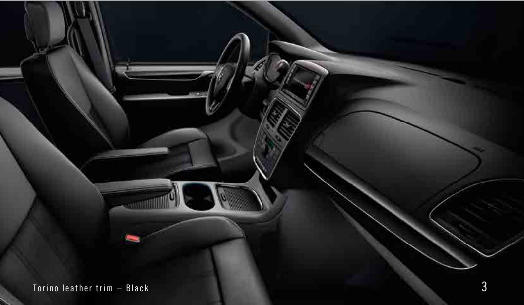
Torino leather trim – Black