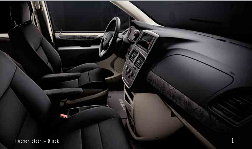
Hudson cloth – Black