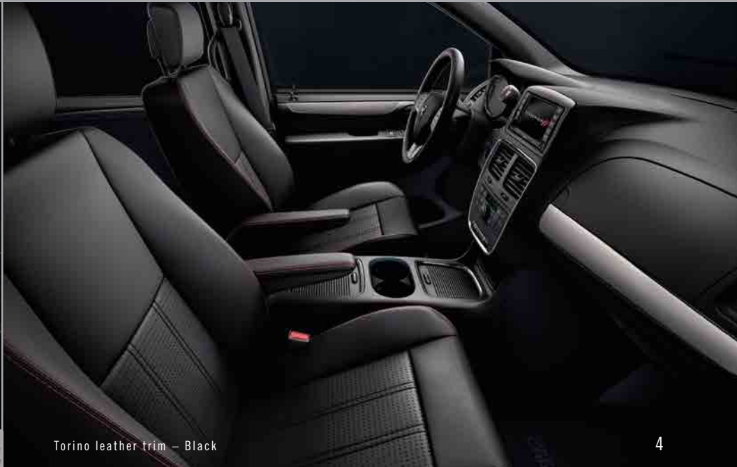
Torino leather trim – Black