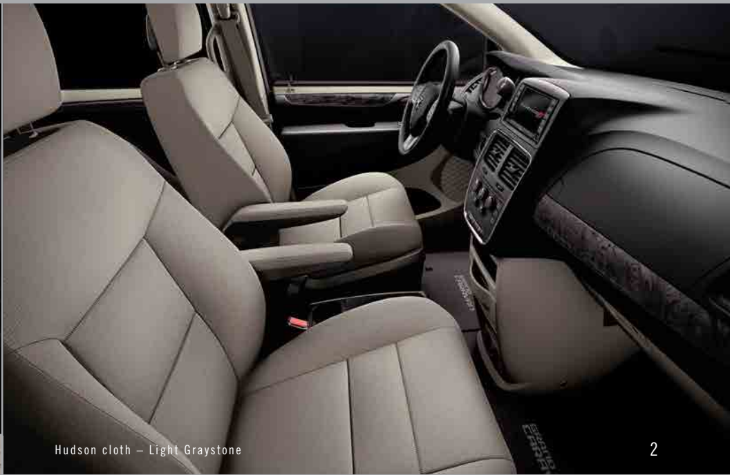
Hudson cloth – Light Graystone